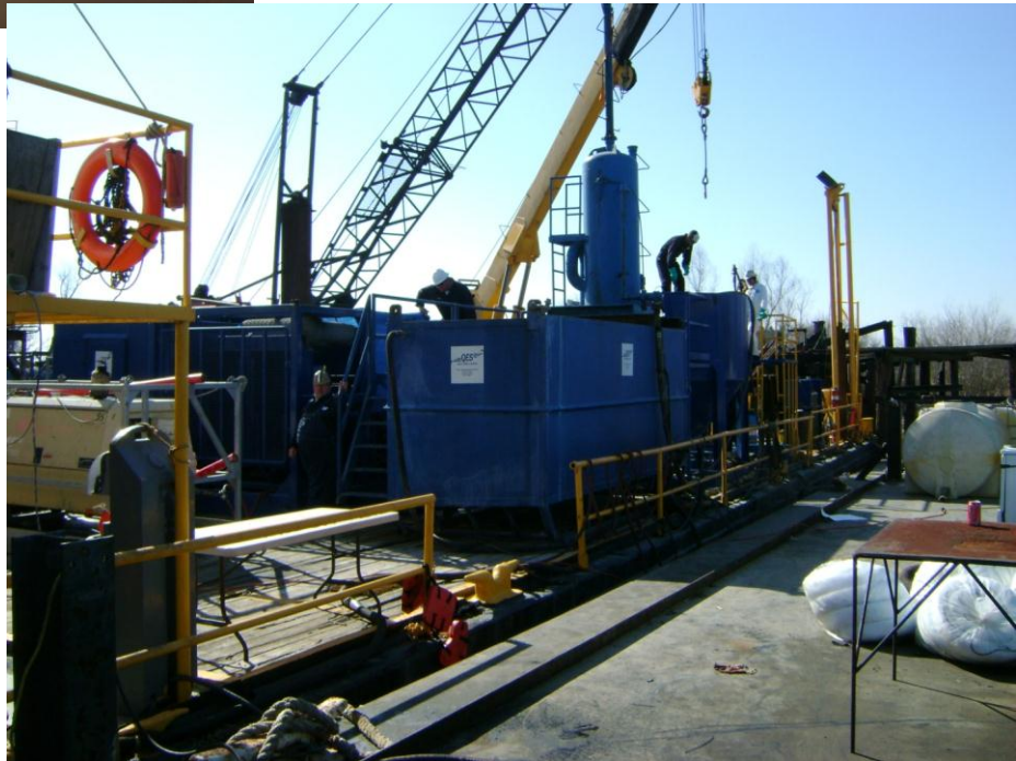
Mixing Cement Plug for Intermediate Plug