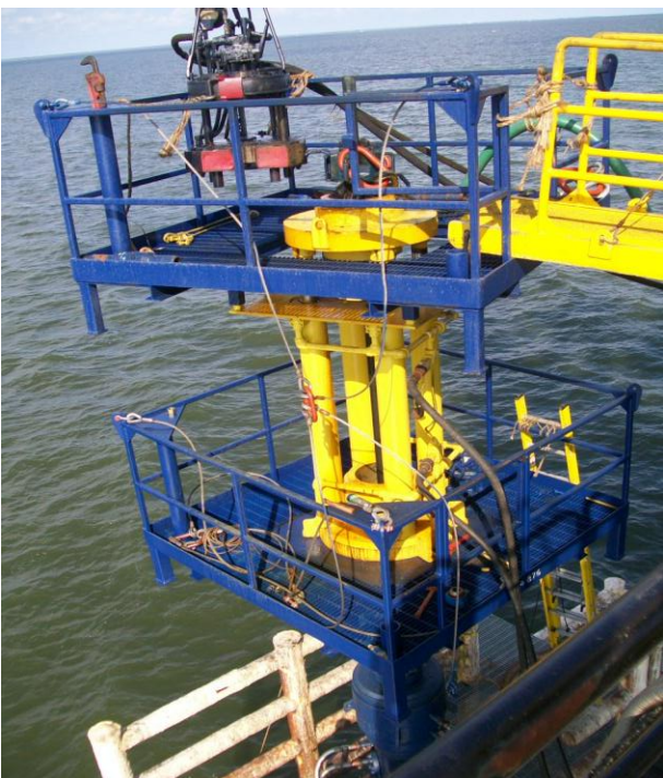
Casing Jacks and Work Baskets