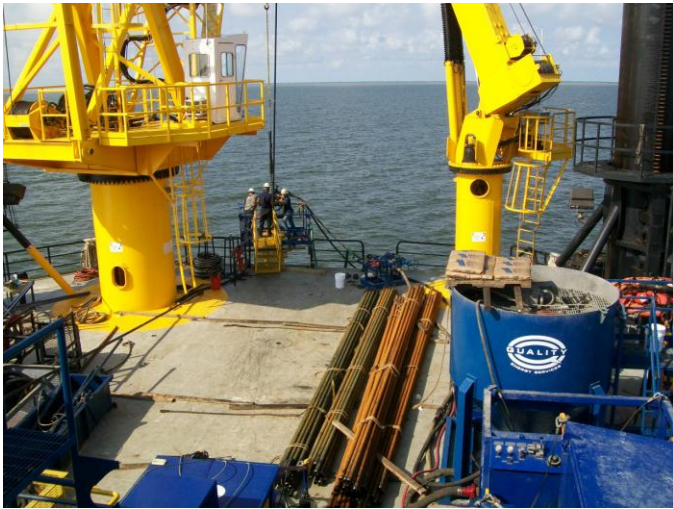
Pulling Tubing – Preparing for QES Logging Unit